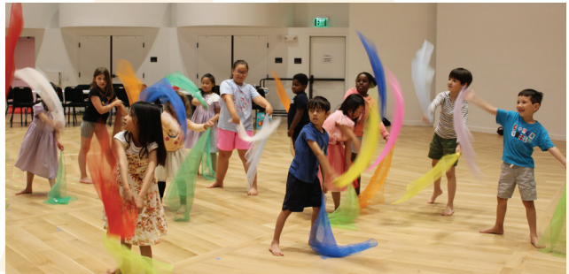
Children ages 6-9 participate in "Musical Kaleidoscope", BYSO's first Dalcroze eurythmics camp where they learn to listen for rhythm, pitch, and more using body movement, voice, and instruments to respond.

Establishing our own space goes beyond serving our current young musicians; it reflects our long-term vision of expanding BYSO's programs and deepening BYSO's impact throughout our communities. With a space of our own, the possibilities are endless to offer high-quality music opportunities beyond our traditional orchestras and to children outside of BYSO.