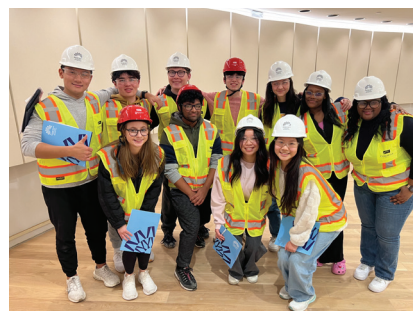
The Ambassadors tour and learn about the history and renovations of the new BYSO Youth Center for Music.