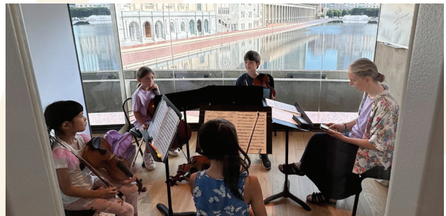
A string Quartet rehearses as part of the BYSO Summer Chamberfest, providing string and piano students an intensive chamber music experience and additional classes on musicianship, theory, chorus, and more.